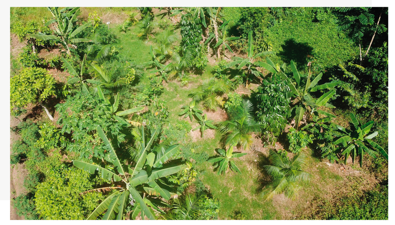
Figure 30.4 Agroforestry system with banana, cupuaçu, taperebá, açaí, ingá, mogno, andiroba, and paricá

Synergies between the bioeconomy and forest restoration Restoration not only reestablishes the forest's ecological functions, such as carbon and biodiversity<sup>44</sup>, but also expands the supply of timber and non-timber forest products (see Chapters 28 and 29). These landscapes then create new opportunities for diversified supply chains, support innovation, create jobs and income, and ultimately improve local people's well-being. Independent of the restoration strategy involved, business opportunities are often created across the restoration