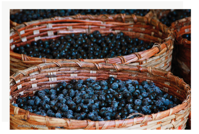
Figure 30.1 Açaí

Important initiatives have also been developed to increase production of Guaraná, involving Indigenous communities<sup>32</sup> and reducing information asymmetry<sup>33</sup>. The market for vegetable oils derived from forest species (e.g., andiroba , ucuúba , cumarú ) is also booming. Although official data does not yet fully cover these products, which play an important role in the diversification of forest products and income sources, there are estimates that