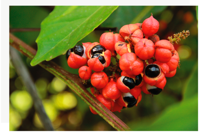
Figure 30.2 Guaraná