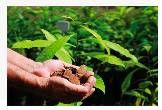
Figure 30.3 Brazil nuts and seedlings in the background

In the case of Brazil nuts, value chains move around USD 450 million globally and involve thousands of families, organized in several small communal businesses<sup>36</sup>. Brazil has been losing ground in international trade due to lack of compliance with basic technological and sanitary regulations (Brazil nuts produced for export to the European Union must meet specific requirements due to the potential presence of aflatoxin) which are difficult for the majority of producers to meet because of their informal and small-scale production<sup>37</sup>. The consequence is that Brazil, unlike Bolivia and Peru, is unable to realize its full potential revenue<sup>37</sup>.